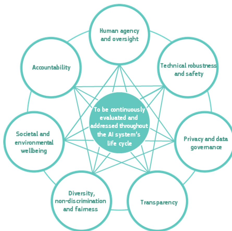
Figure 2: Interrelationship of the seven requirements: all are of equal importance, support each other, and should be implemented and evaluated throughout the AI system's lifecycle

While all requirements are of equal importance, context and potential tensions between them will need to be taken into account when applying them across different domains and industries. Implementation of these requirements should occur throughout an AI system's entire life cycle and depends on the specific application. While most requirements apply to all AI systems, special attention is given to those directly or indirectly affecting individuals. Therefore, for some applications (for instance in industrial settings), they may be of lesser relevance.