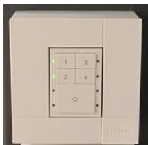
push button panel

If no one is in the room, the lighting is automatically switched off by motion detectors.