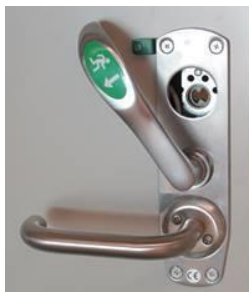
angled emergency exit handle

The angled green emergency exit handles may only be used for emergency evacuation as they trigger the alarm when used.