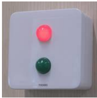
pressure deviation in lab

If the alarm is triggered the door must be closed. A green light indicates that the pressure difference has been restored and cell culture activities can continue.