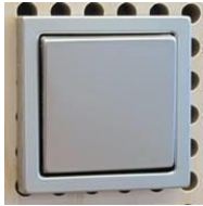
spring-return push button

If no one is in the room, the lighting is automatically switched off by motion detectors.