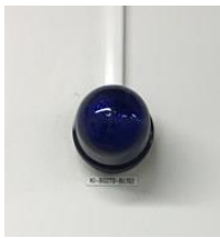
oxygen alarm flashing light

Rooms/labs in which liquid nitrogen is handled are fitted with an alarm that is triggered if the oxygen level drops too low. The alarm is local and is indicated by a sound and a blue flashing light outside the affected room. It is important that upon seeing and hearing this alarm that you check whether anyone is in danger.