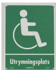
sign at evacuation point

A temporary evacuation point comprises a separate fire compartment and is equipped with an emergency phone for two-way communication. When you press the red button, an alarm is sent to a station staffed 24 hours a day. Voice communication is established with the evacuee and assistance is arranged.