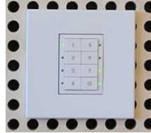
push button panel