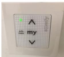
push button blackout curtains

The building's smaller meeting rooms have motorised blackout curtains which are operated by push buttons.