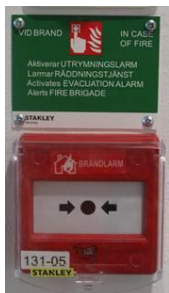
push button in case of fire

If two smoke detectors have detected smoke, the fire alarm is forwarded to the emergency services (SOS Alarm) . You can trigger the fire alarm by using the red buttons along the escape routes.