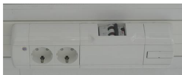
electrical outlet on KB rail.