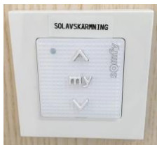
push button sun shades

The facade in the general lab has exterior sun shades which can be lowered by zone and manually with remote controls. Lowered sun shades return to automatic control once every 24 hours.