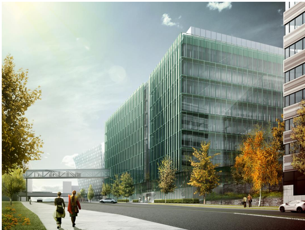
Illustration Architect: CF Møller