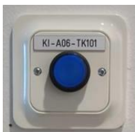
chemical spill push button

Once the block has been evacuated, only authorised personnel may enter the premises until decontamination is completed.