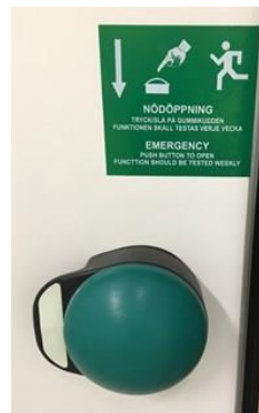
emergency opener 2 nd floor