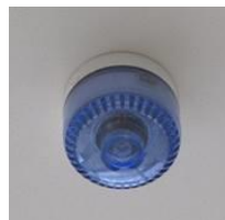
flashing light - chemical spill