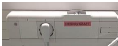
auxiliary electrical outlet on KB rail